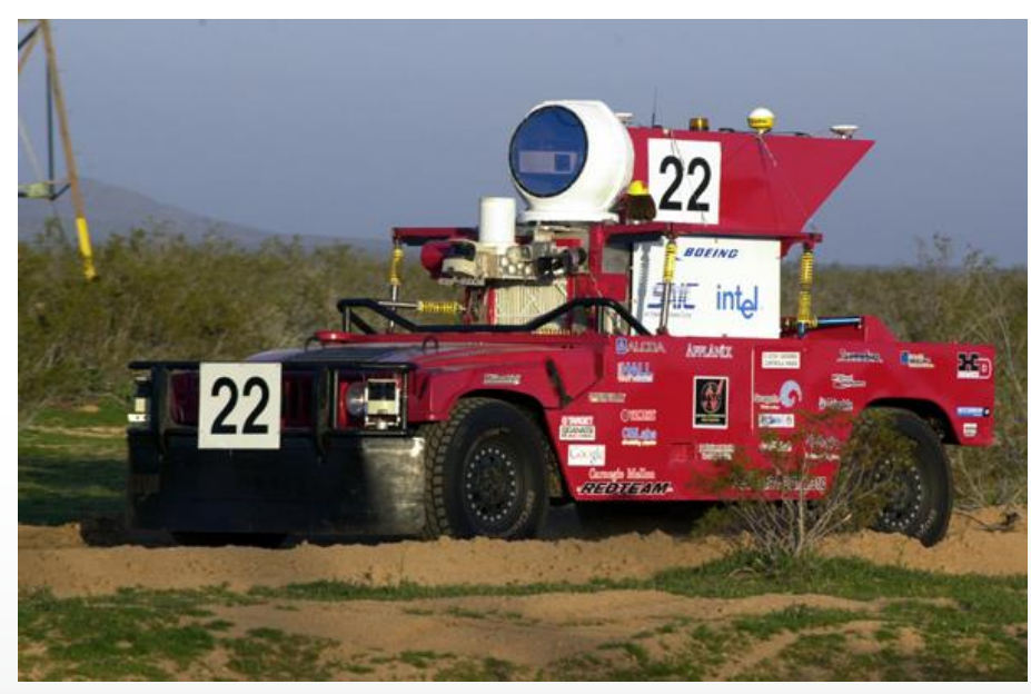
2004 DARPA Grand Challenge Entrant